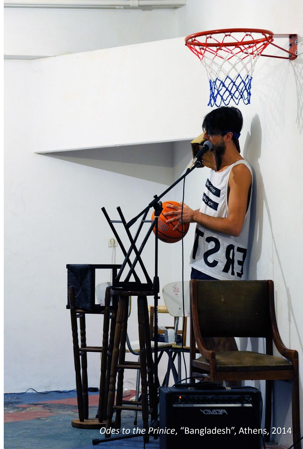
Odes to the Prince , "Bangladesh", Athens, 2014

http://www.novamelancholia.gr/en/directors/2-manolis-tsipos/productions/22-lord-why-me