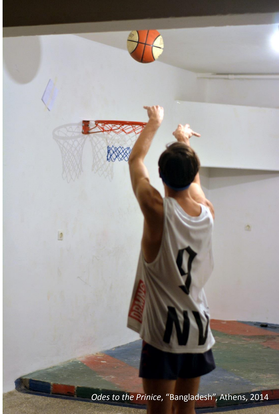
Odes to the Prince , “Bangladesh”, Athens, 2014

http://www.novamelancholia.gr/en/directors/1-vasilis-noulas/productions/16-meditation-i-concerning-those-things-that-can-be-called-into-doubt